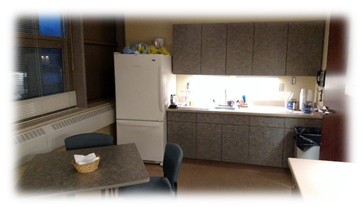
Furnished Break Room Area