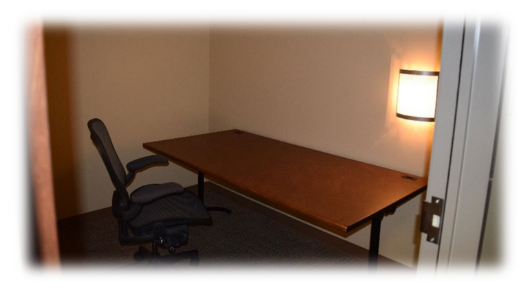
"Typical" "Junior Office Partner" Workspace