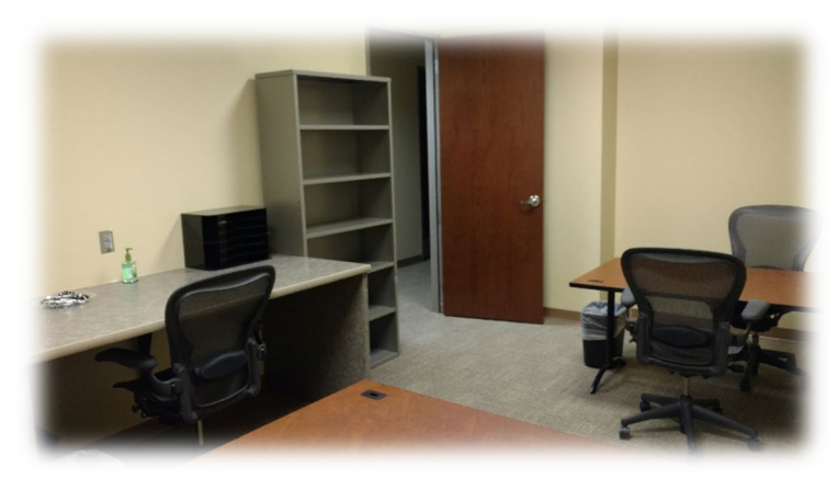
"Typical" Associate Designated Work Room Area