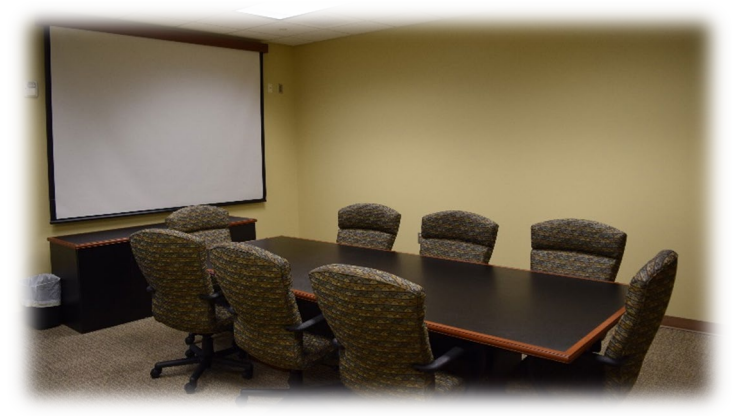
Conference Room With Screen & Whiteboard