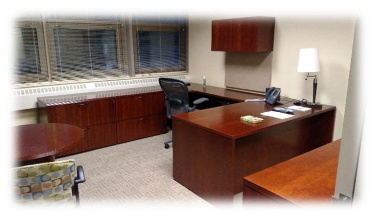
Typical "Senior Office Partner" Workspace